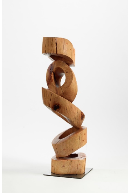
Coin Toss , 2022, wood, 58 x 18 x 16 inches

Reception for the Artist, July 13, 5-7PM