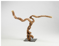
Sam Perry Loose Ends , 2024 wood 31 x 45 x 15 in.