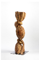
Sam Perry Surprise , 2023 wood 74 x 25 x 27 in.