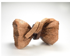
Sam Perry Scrunchie , 2024 wood 14 x 18 x 12 in. (35.6 x 45.7 x 30.5 cm) PERSA-SC-0118