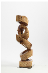
Sam Perry Coin Toss , 2022 wood 56 x 18 x 16 in.