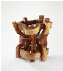
Sam Perry Cage , 2022–24 wood 51 x 50 x 49 in. (129.5 x 127 x 124.5 cm) PERSA-SC-0116