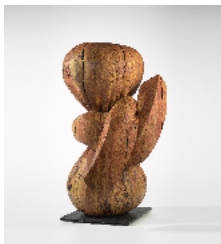
Sam Perry Double Bubble , 2023 wood 30 x 16 x 16 in.