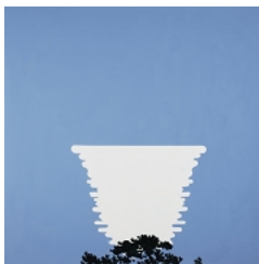
Pacific Ocean II, 2017 Acrylic on canvas 39 1/2 x 39 1/2 in.