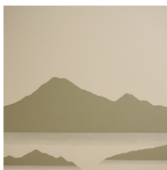
Row of Mountains, 2017