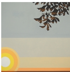
The Time until Dinner, 2017 Acrylic on canvas 39 1/2 x 39 1/2 in.