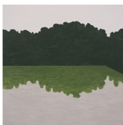
Moat (Nagoya Castle I), 2017