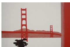
San Francisco on That Day, 2017