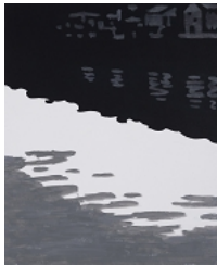
Morning at Harbor, 2017 Acrylic on canvas 28 1/2 x 23 3/4 in.