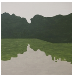
Moat (Nagoya Castle II), 2017 Oil on canvas 39 1/2 x 39 1/2 in.