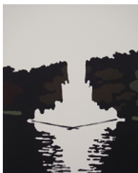
Fountain on That Day, 2017 Acrylic on canvas 31 1/2 x 25 1/2 in.