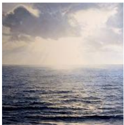
Dwelling in Air 2017 Oil on wood 50 x 50 in. (127 x 127 cm)