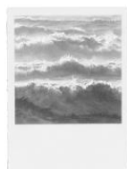
Graphite Waves VI 2012 Pencil on paper 30 x 22 1/2 in. (76.2 x 57.1 cm)