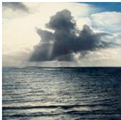
Passing Cloud 2015 Oil on wood 30 x 30 in. (76.2 x 76.2 cm)