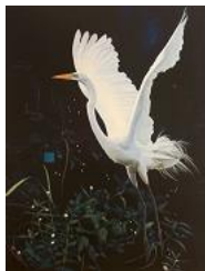
Louisiana Drift II 2017 Oil on wood 50 x 38 in. (127 x 96.5 cm)