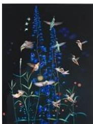
Flight II 2015 Oil on wood 40 x 30 in. (101.6 x 76.2 cm)