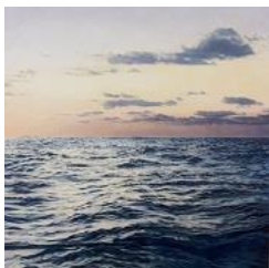
Shipping Lane II 2018 Oil on wood 40 x 40 in. (101.6 x 101.6 cm)