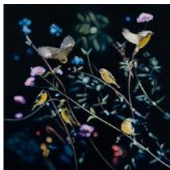
Goldfinches in Garden 2018 Oil on wood 30 x 30 in. (76.2 x 76.2 cm)