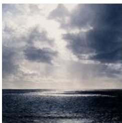
The Wind 2012 Oil on wood 50 x 50 in. (127 x 127 cm)