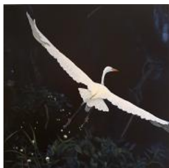
Louisiana Drift I 2017 Oil on wood 30 x 30 in. (76.2 x 76.2 cm)