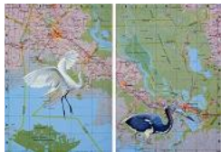
Louisiana Drift Avery Island 2015 Gouache on map Paper size: 15 x 10 1/2 in. (each) Framed size: 18 x 24 3/4 in.