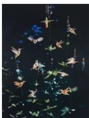
Flight I 2015 Oil on wood 40 x 30 in. (101.6 x 76.2 cm) HALDI-PA-0008