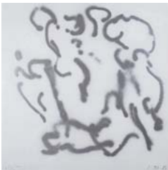
No. 2, 2018 (1.31.18) 2018 Oil-based paints on panel 72 x 72 in. (182.9 x 182.9 cm)