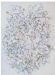
Handcolored Woodblock Print (7.21.08) 2008 Woodblock print, mixed media on paper 29 3/4 x 22 in. (75.6 x 55.9 cm)