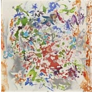
Painting (12.15.10) 2010 Mixed media on canvas 20 1/4 x 20 1/4 in. (51.4 x 51.4 cm)