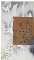
No. 14, 2015 (12.1.15) 2015 Mixed media on masonite 25 1/2 x 14 1/2 in. (64.8 x 36.8 cm)