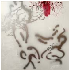
No. 3, 2018 (2.5.18) 2018 Oil-based paints on panel 72 x 72 in. (182.9 x 182.9 cm)