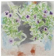
Painting (12.22.10) 2010 Mixed media on canvas 22 1/4 x 22 3/4 in. (56.5 x 57.8 cm)