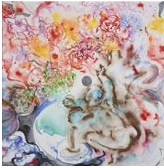
Painting (1.1.11) 2011 Mixed media on canvas 65 3/4 x 64 1/4 in. (167 x 163.2 cm)