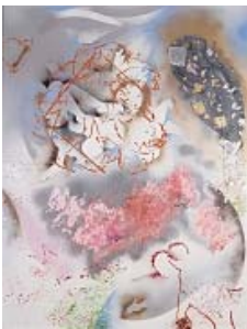
No. 1, 2017 (3.13.17) 2017 Oil-based paints, mixed media on panel 95 x 72 in. (241.3 x 182.9 cm)