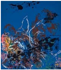
No. 10, 2017 (9.5.17) 2017 Oil-based paints on panel 44 x 40 in. (111.8 x 101.6 cm)