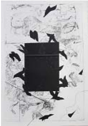
Composite (10.30.12) 2012 Intaglio print, mixed media on paper 38 5/8 x 27 in. (98.1 x 68.6 cm)