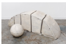
Semi-Circle Sphere 2004 Ceramic 25 x 39 x 73 inches Inv. #DG0054CS