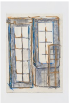
Untitled n.d. Pastel on paper 41 x 29 inches Inv. #DG0129WP