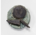
Untitled n.d. Ceramic 22 x 22 x 4 inches Inv. #DG0021CP