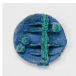
Untitled n.d. Ceramic 22 x 22 x 4 inches Inv. #DG0019CP