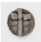
Untitled n.d. Ceramic 22 x 22 x 4 inches Inv. #DG0004CP