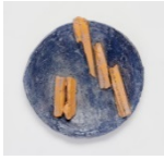
Untitled n.d. Ceramic 22 x 22 x 4 inches Inv. #DG0009CP