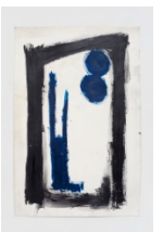
Untitled n.d. Acrylic on paper 41 ½ x 30 inches Inv. #DG0162WP