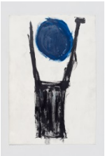
Untitled n.d. Acrylic on paper 44 ½ x 30 inches Inv. # DG0163WP