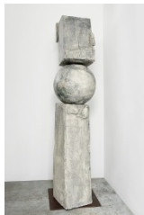
Untitled 1991 Ceramic 92 x 25 x 23 inches Inv. #DG0041CS