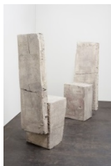
Chairs Facing Each Other 2006 Ceramic 55 inches high, dim. variable Inv. #DG0054CS