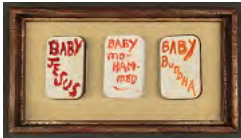
Baby, Baby, Baby 2008

Lithograph (ink on paper with brown wash) 19 1/2 x 15 in. (49.5 x 38.1 cm)