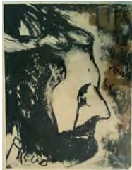
Freud...Life is a real dream 1992

Oil and acrylic on canvas 18 x 12 inches (each)