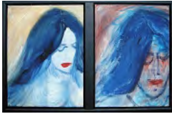
Vivienne Eliot in 1915 Upon Marriage to T.S. Eliot and in 1938 Upon Entering an Asylum 2009

Oil and acrylic on canvas 18 x 12 inches (each)