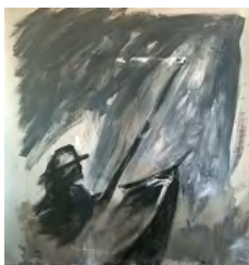
Voyage to the Unknown