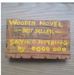
Wooden Novel 2001

Acrylic on LP record 12 x 12 x 12 in. (30.5 x 30.5 x 30.5 cm)