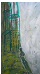
The Hours Rise Up (e.e. cummings Suite #1)