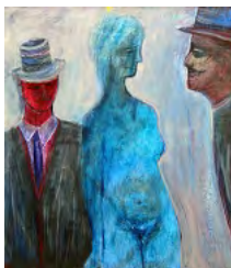
Before the Revolution