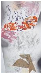
No. 13, 2015 (10.18.15) 2015 Mixed media on masonite 25 1/2 x 14 1/2 in. (64.8 x 36.8 cm)