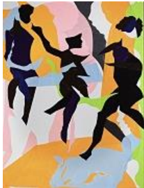
Ghost II (5.21.15)

Applied fabric, mixed media on panel 95 x 72 in. (241.3 x 182.9 cm)