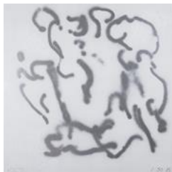
No. 2, 2018 (1.31.18) 2018 Oil-based paints on panel 72 x 72 in. (182.9 x 182.9 cm)