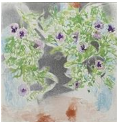
Painting (12.22.10) 2010 Mixed media on canvas 22 1/4 x 22 3/4 in. (56.5 x 57.8 cm)