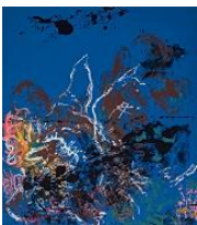
No. 10, 2017 (9.5.17) 2017 Oil-based paints on panel 44 x 40 in. (111.8 x 101.6 cm)