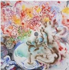
Painting (1.1.11) 2011 Mixed media on canvas 65 3/4 x 64 1/4 in. (167 x 163.2 cm)