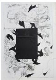
Composite (10.30.12) 2012 Intaglio print, mixed media on paper 38 5/8 x 27 in. (98.1 x 68.6 cm)