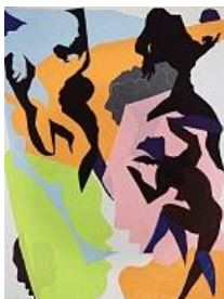
Ghost III (6.8.15)

Applied fabric, mixed media on panel 95 x 72 in. (241.3 x 182.9 cm)