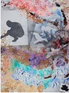
No. 11, 2017 (10.1.17) 2017 Oil-based paints on panel 95 x 72 in. (241.3 x 182.9 cm)