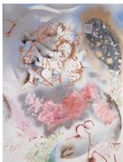
No. 1, 2017 (3.13.17) 2017 Oil-based paints, mixed media on panel 95 x 72 in. (241.3 x 182.9 cm)