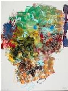
No. 4, 2017 (6.6.17) 2017 Oil-based paints on panel 95 x 72 in. (241.3 x 182.9 cm)