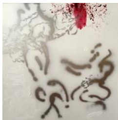
No. 3, 2018 (2.5.18) 2018 Oil-based paints on panel 72 x 72 in. (182.9 x 182.9 cm)