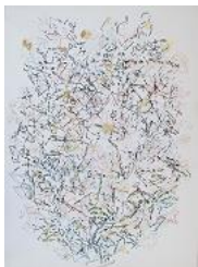
Handcolored Woodblock Print (7.21.08) 2008 Woodblock print, mixed media on paper 29 3/4 x 22 in. (75.6 x 55.9 cm)