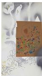
No. 14, 2015 (12.1.15) 2015 Mixed media on masonite 25 1/2 x 14 1/2 in. (64.8 x 36.8 cm)