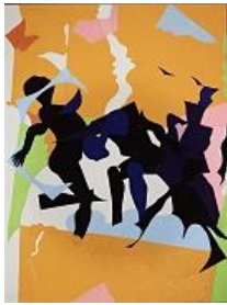
Ghost I (3.20.15)

water-based pigments on canvas 64 1/4 x 64 1/4 in. (163.2 x 163.2 cm)