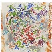
Painting (12.15.10) 2010 Mixed media on canvas 20 1/4 x 20 1/4 in. (51.4 x 51.4 cm)